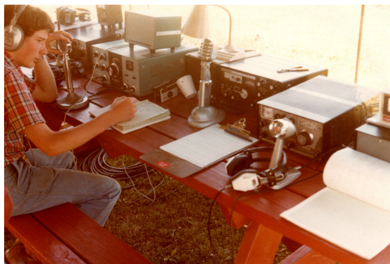
Operating position— can you guess who this is?