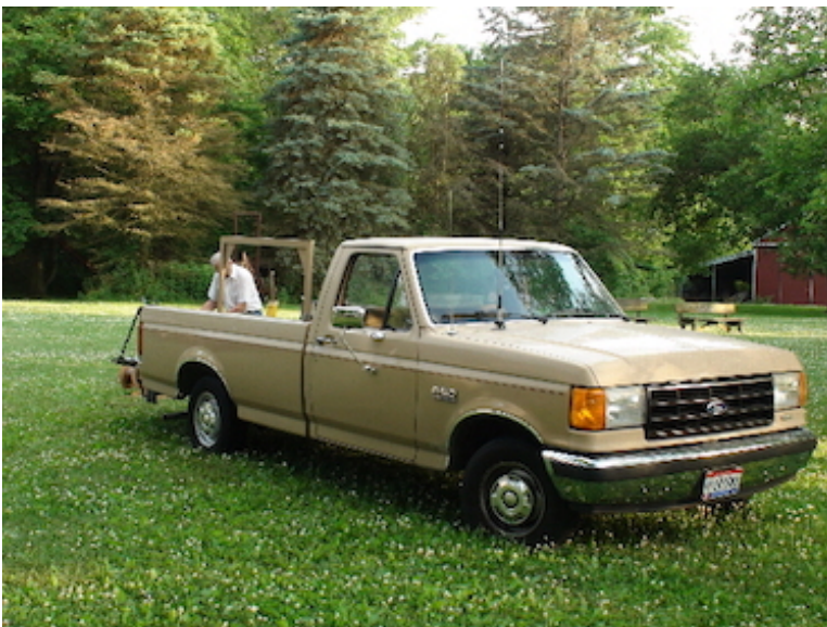
Phil, W8PSK, prepping for putting up the loop