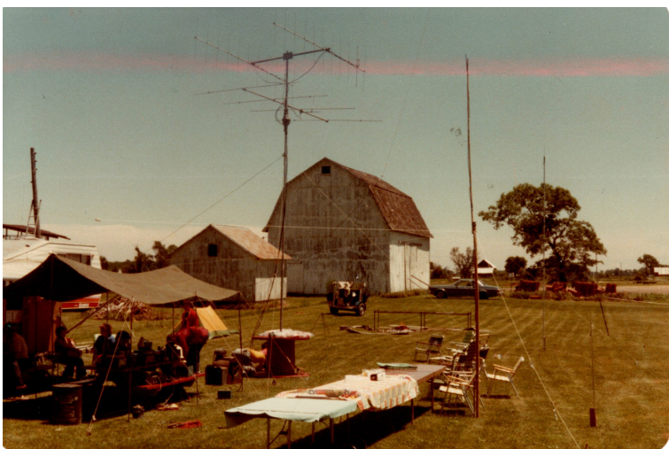
view of operating tent with antennas