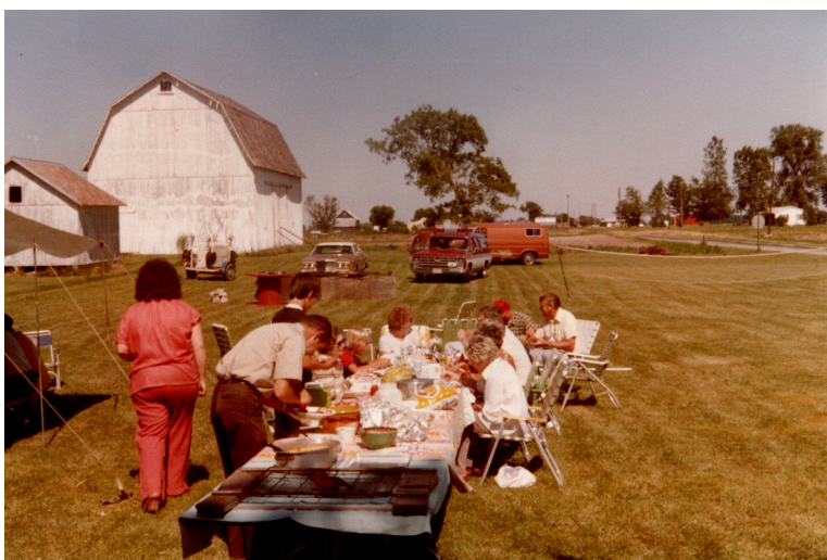
as always, food is an important part of FD participation