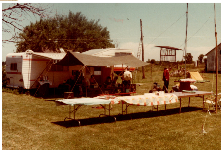
wide shot including food tables— OM in red jacket is Bob, K3RC