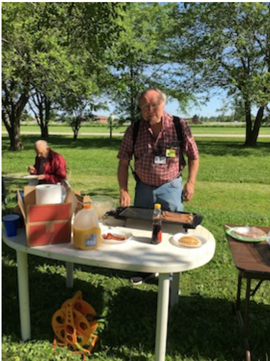
Master chef WB8NQW cooking flapjacks and bacon for breakfast