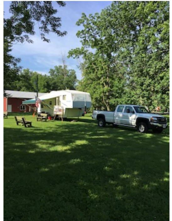
KE8CVA-Terry's operation center using dipole antenna