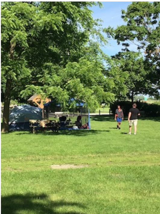
KD8NJZ-Eban and NM8W-Craig in front of their operating tent