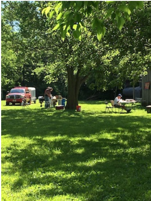
WB8NQW-Bob prepping breakfast N1RB-Bob on CW using loop antenna