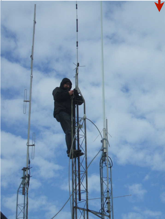
Craig at the top ↓