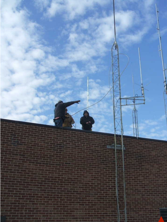
NM8W, WB8NQW and WD8ICP ↑ assess the chilly situation