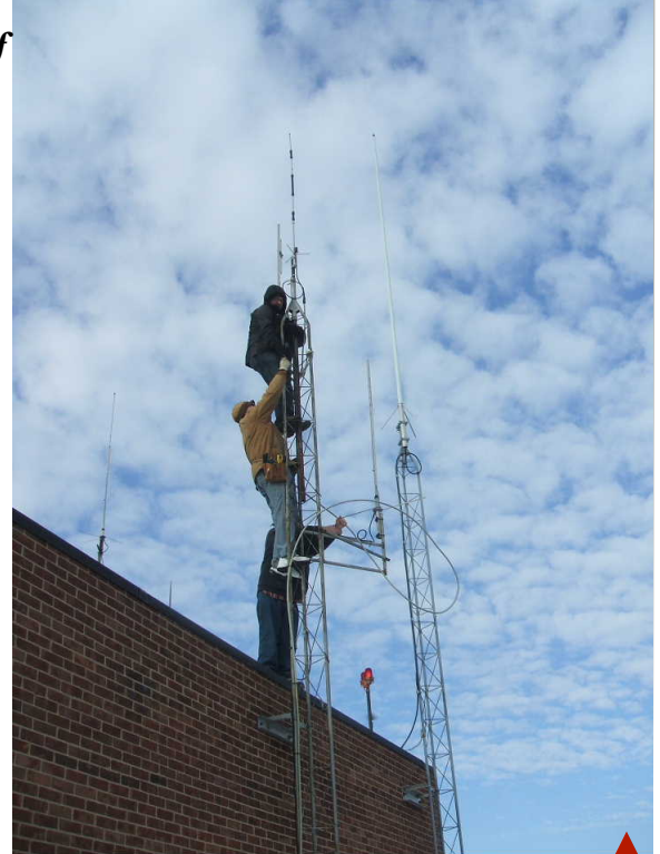
NM8W, WB8NQW and WD8ICP at the tower ↑