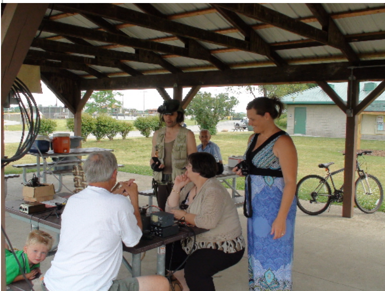
hams of all ages