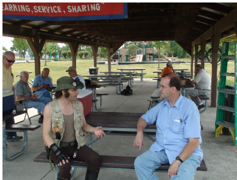
explaining the activities to a visitor