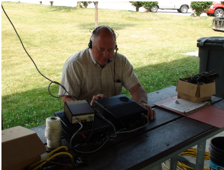
tuning the band

web: http://www.aladdinshrine.com/hamfest.htm