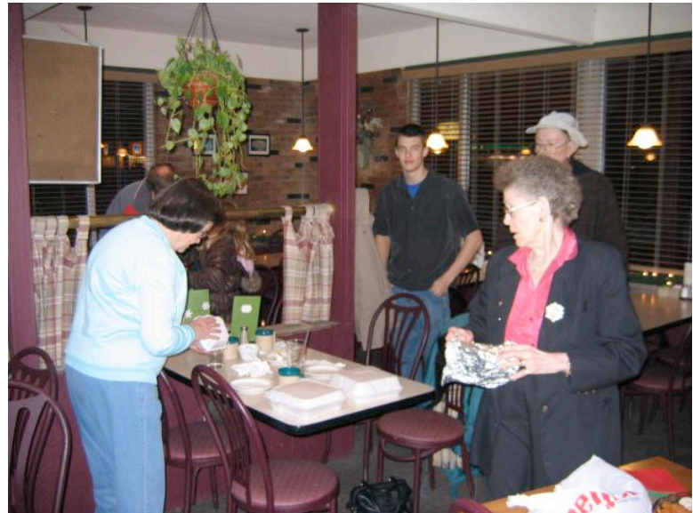
and even more conversation