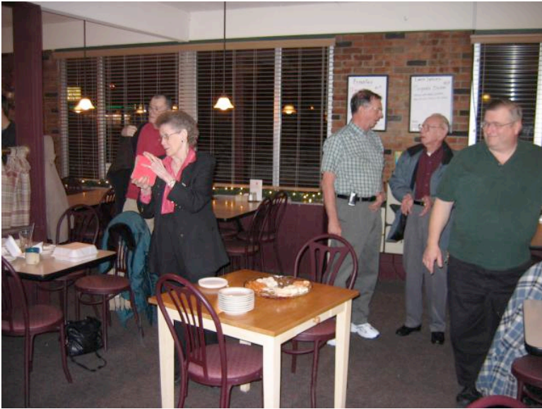
Orbiting around the candy table