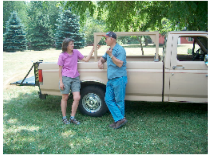
informal meeting of BPL committee