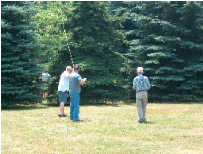
the hf loop is going up!