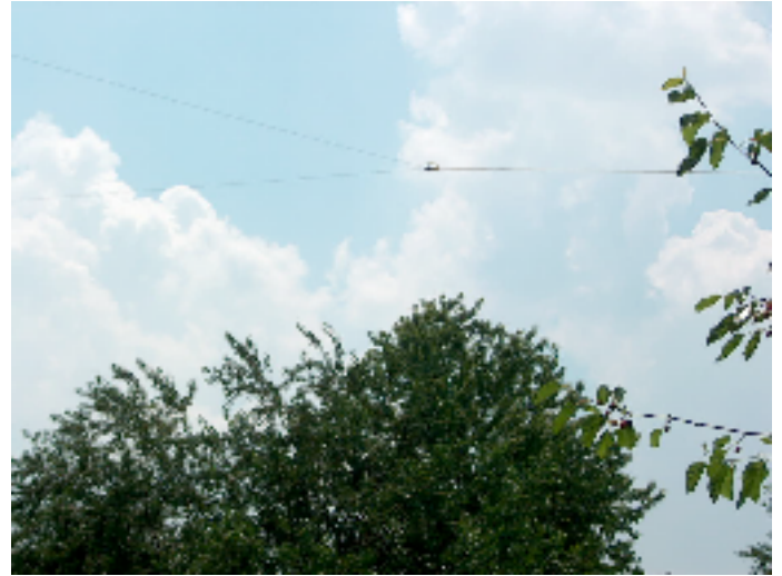
loop in the ether