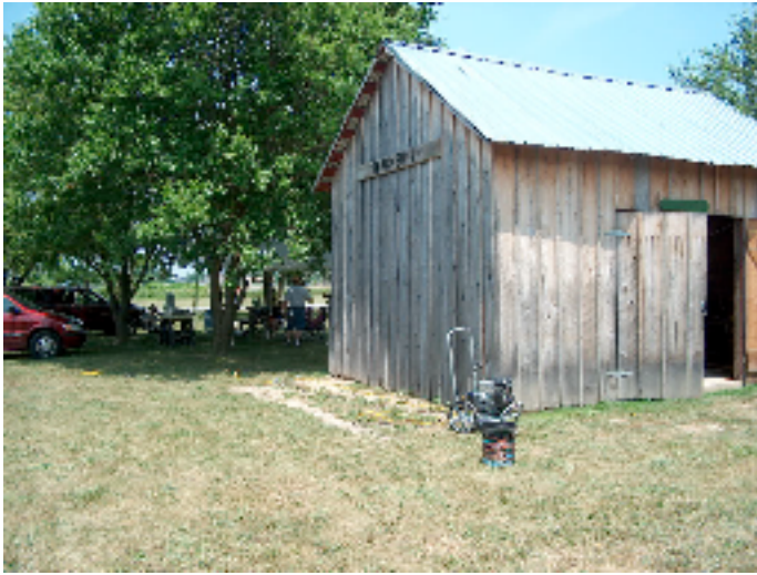
the source of all power