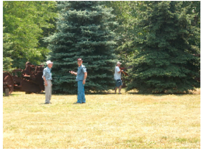
where'd that rope go?