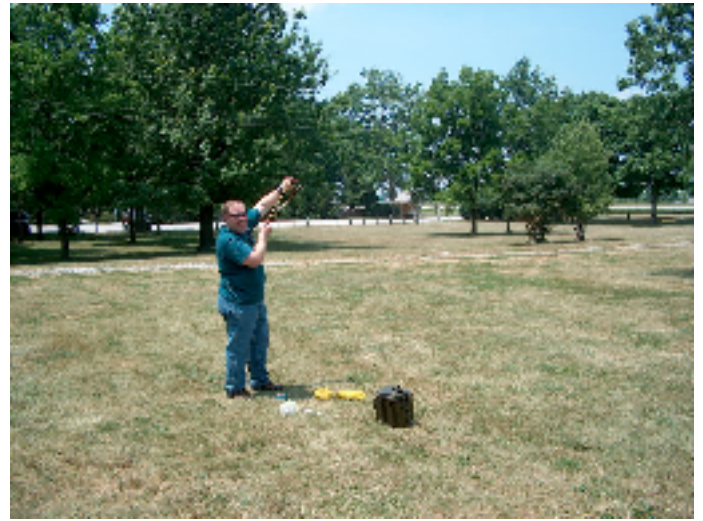
dead eye, KG8FH