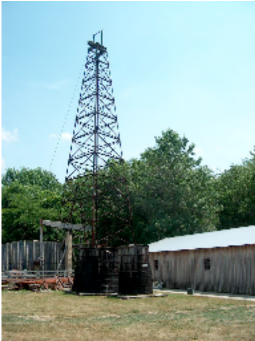
one corner of the loop