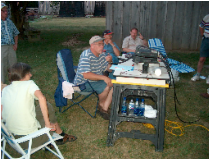
and now we're operating!