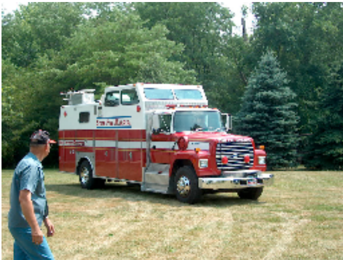
State Fire Marshal's Com Van visits WCARC FD site