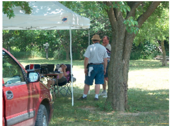
plans are being made