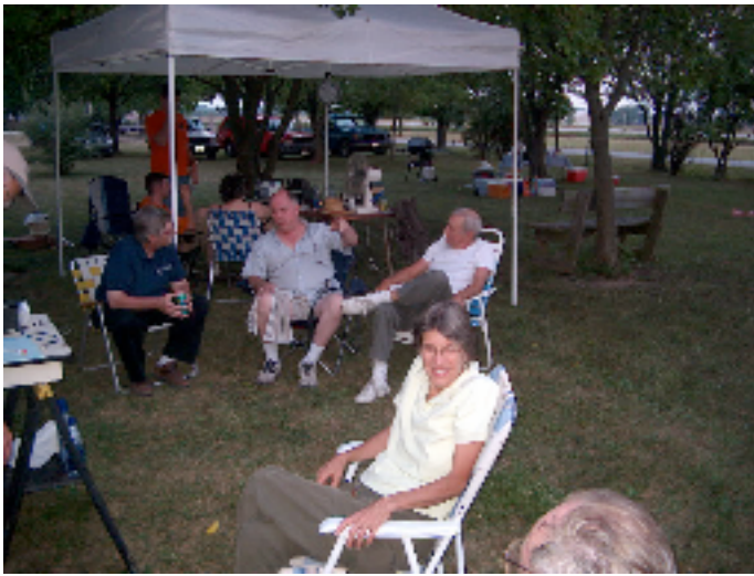
time to catch up on what's been happenin'