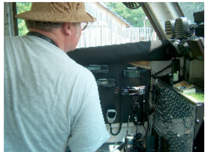
wonder if all this will fit in my truck?