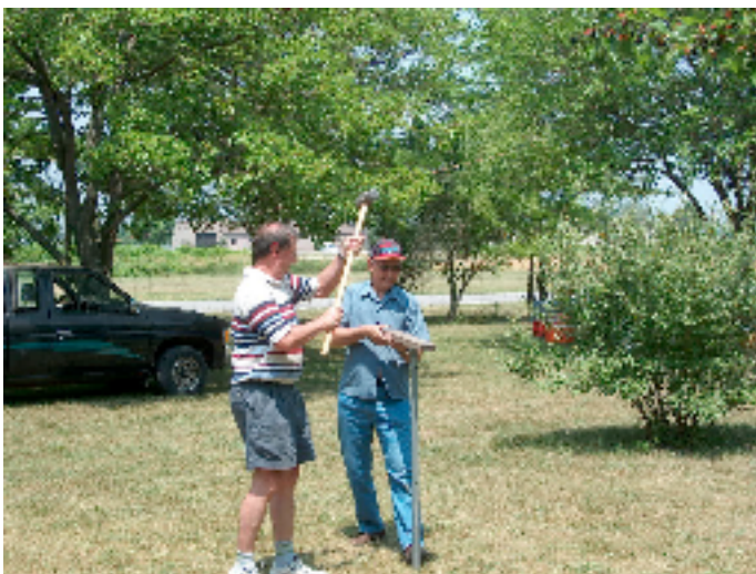
watch the thumbs!