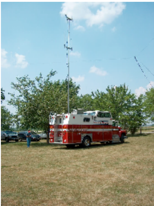
Fire Marshal's Com Van with antennas extended