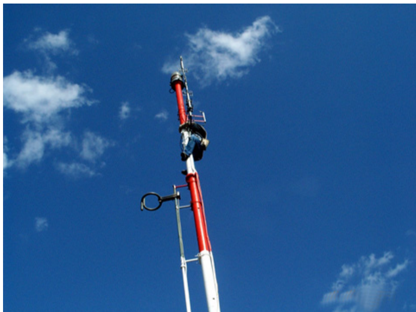
The antenna is in place-- a job well done!!