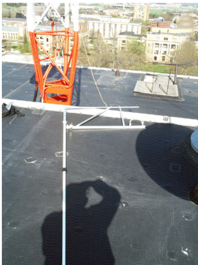
It's ready to go - mystery person in the shadow